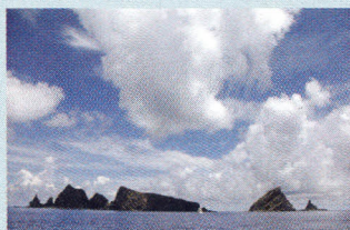
53 Narrative of an empty space: China, Japan and those islands 59 Japan's Citizen Kane