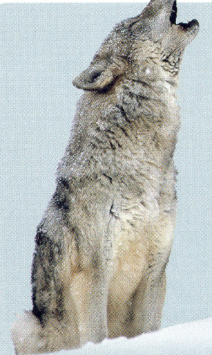
125 The return of the wolf