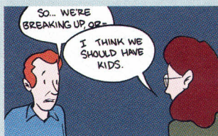
129 Internet comic strips: the triumph of the nerd