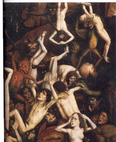
25 A rough guide to Hell 31 Mardi Gras Indians