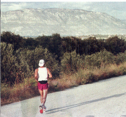
85 The Spartathlon: Greece's historical ultra-marathon