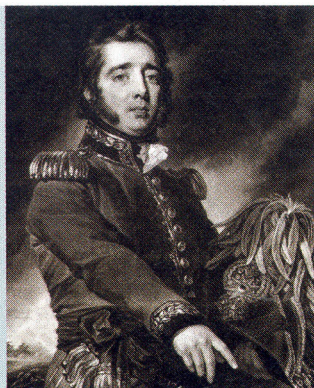
109 Gregor MacGregor, king of con-men