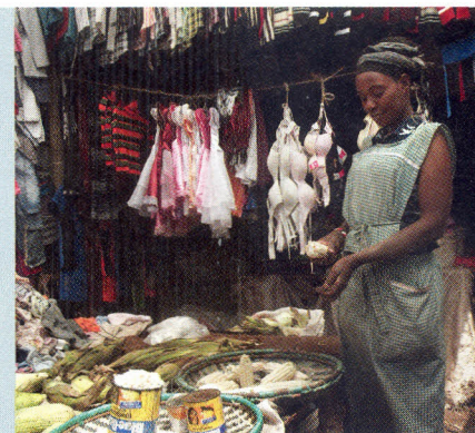
72 Kibera: Africa's boomtown slum