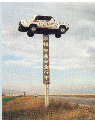
63 Driving to Tibet: Get your kicks on route G6