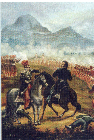
45 Paraguay's terrible history