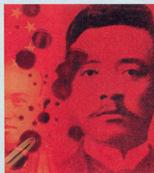
66 The assassination of Song Jiaoren: China's lost chance of democracy?