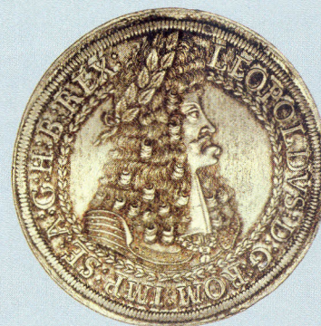
78 The Holy Roman Empire and the euro crisis