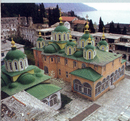
89 The battle over the name of God