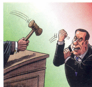
Berlusconi Another tangle with the law for the former prime minister, but his political death holds dangers for Italy: Charlemagne, page 56. Greeks also have problems with taxes, page 54