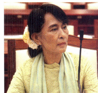
Myanmar Rohingyas need the help of their government, Aung San Suu Kyi and the outside world: leader, page 14. Not long ago derided, a gutsy Burmese parliament now challenges the president, page 39. The plight of the Rohingyas: Banyan, page 44