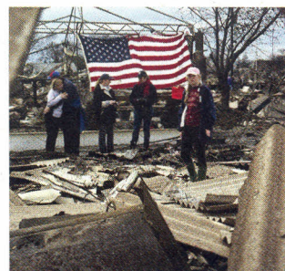
The storm Counting the cost of Sandy, page 27. A millennium-and-a-half ago, Geneva was destroyed by a giant wave. Recent research suggests it could happen again, page 79