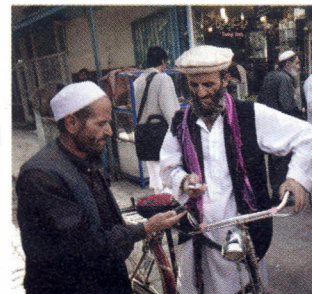
Afghanistan Much has gone wrong, but the progress that has been made should not be thrown away: leader, page 10. Afghanistan faces three momentous transitions. How it handles them will determine its future, page 41