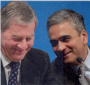
Deutsche Bank Hard questions loom for the new bosses of Germany's national banking champion, page 74. The rise of Kotak, an Indian powerhouse, page 73