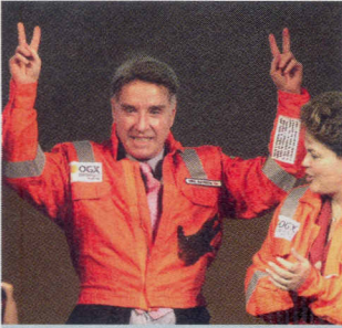
Brazil's richest man Eike Batista is betting big on resources and infrastructure, page 63