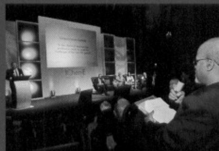
Chewing the Global Forum cud – p 20