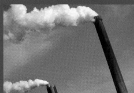
Emissions: carbon trading enters a new phase – p 50