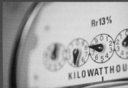
Waste: turning waste into watts – p 36