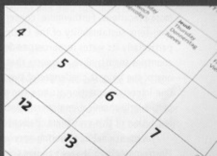
Guest author: REACH implementation is here – p28