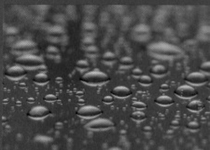
Water: Providing solutions to the developing world – p31