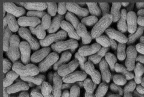
Nuts about biofuels – p22