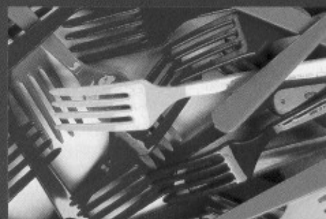
Innovative plastic solutions – p32