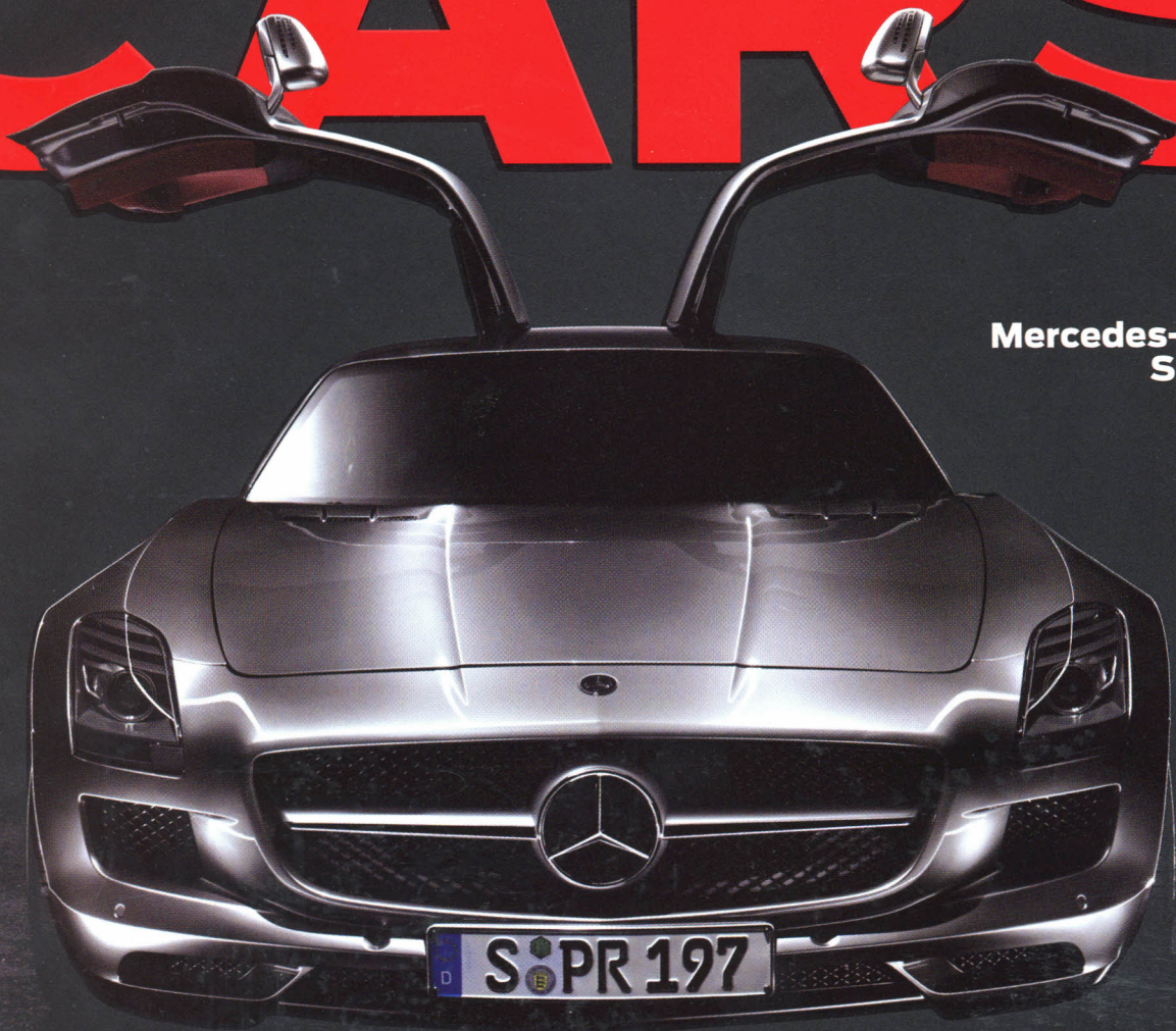
Mercedes-Benz SLS AMG