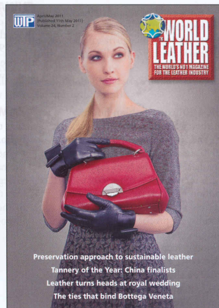
Cover image: Image courtesy of International Leather Goods Fair Offenbach from its Winter Styles event in late March 2011.

IMAGE CREDIT: INTERNATIONAL LEATHER GOODS FAIR OFFENBACH