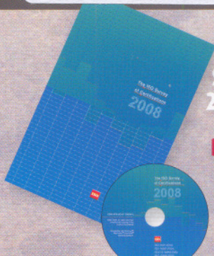
The ISO Survey 2008