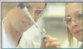
Swine flu vaccine and ISO 9001