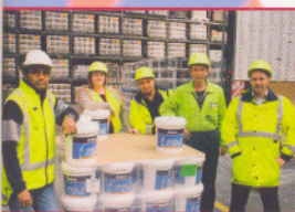
Dulux paints it green