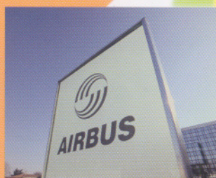
Airbus and ISO 14001