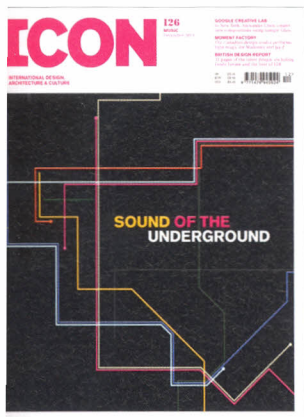
over IMAGE: ALEXANDER CHEN