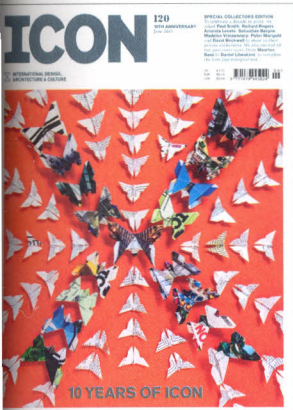
cover RIGAMI DESIGN: KYLE BEAN