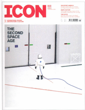
Cover IMAGE: VINCENT FOURNIER