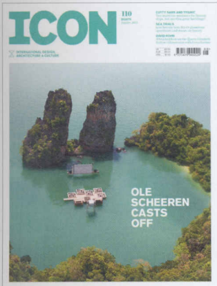
Cover IMAGE: DOUG BRUCE