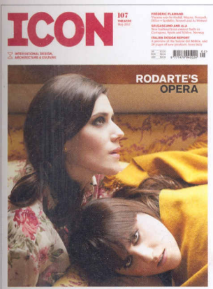
Cover IMAGE: AUTUMN DE WILDE