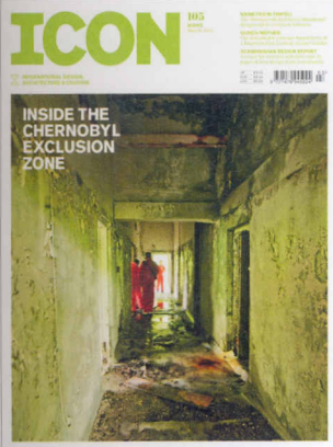
Cover IMAGE: BRYAN ALLEN