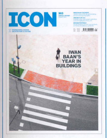
Cover IMAGE: LISA PRAM