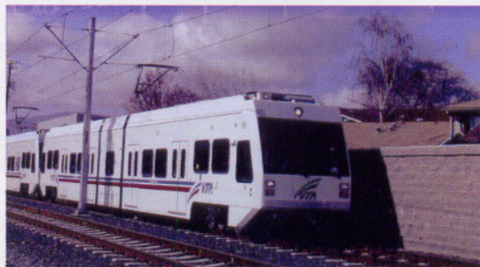
CIWMB programs launched new uses for tire derived materials like the use of tire chips to reduce vibration on lightweight rails.